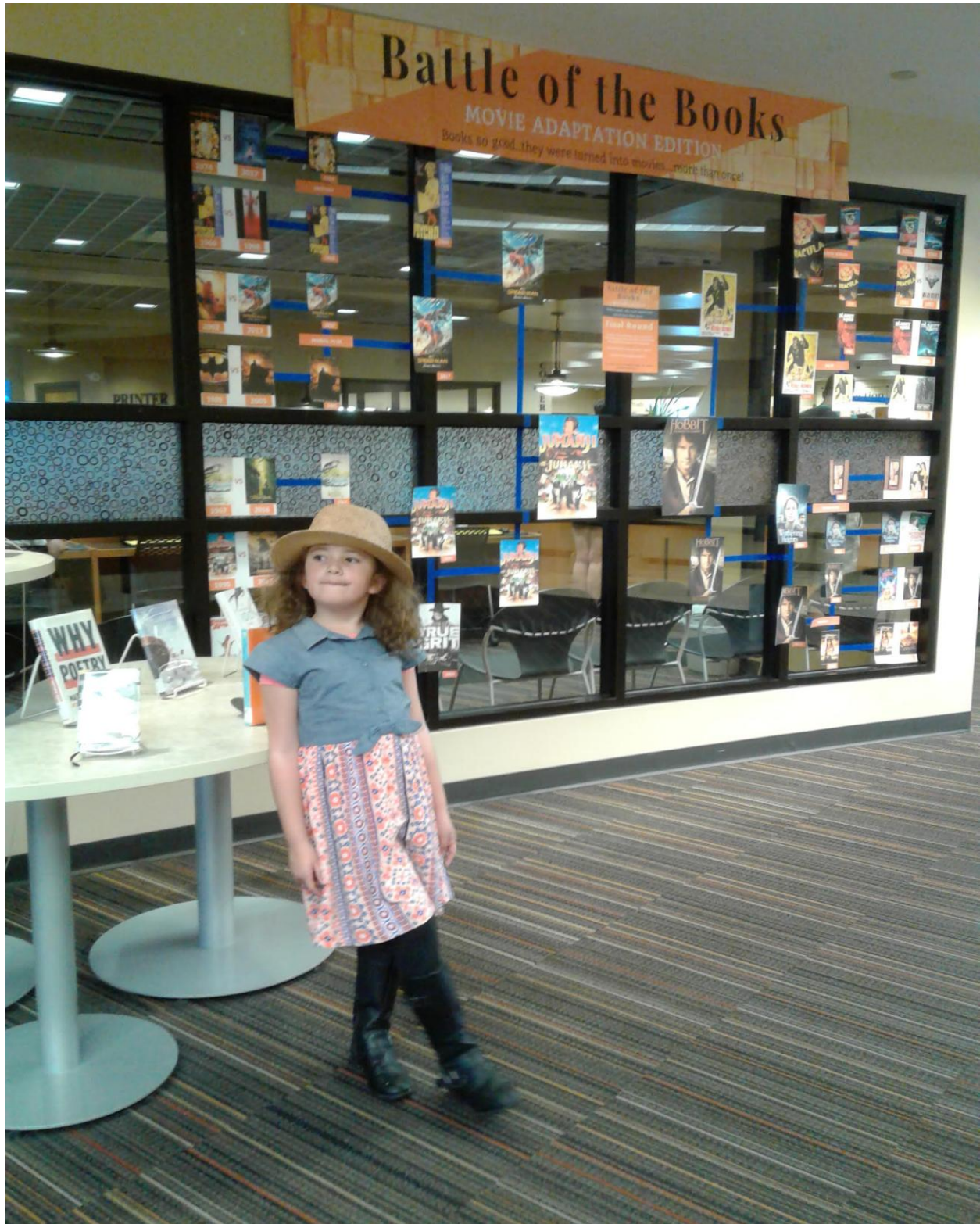
Daleth can read 1